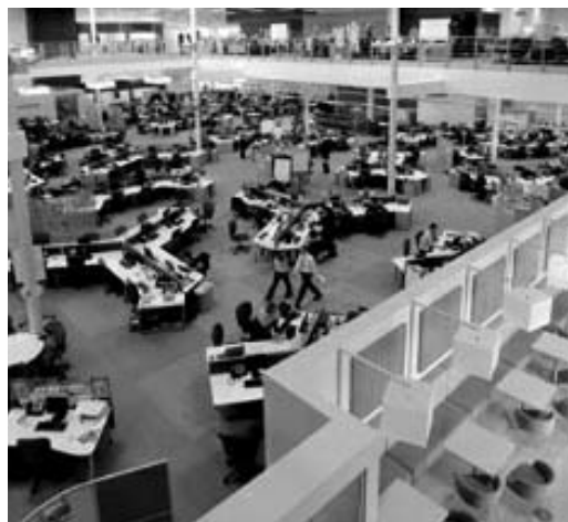
Norwich Union call centre at Broadland Business Park.

Norwich Union is Aviva's brand name in the UK.